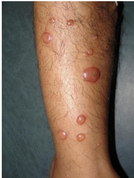
Figure.1 Tense Bullae Pemphigoid leg in case -1

MP=Mid pulse, dexamethasone 100 mg for 2 day, ND= Not done, M=Month, Y=year, IIF=Indirect immunofluorescence test, DIF=Direct immunofluorescence test