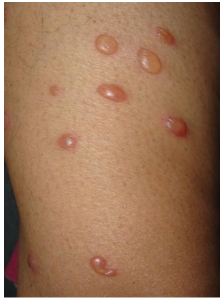
Figure.2 Tense Bullae Pemphigoid abdomen in case -2