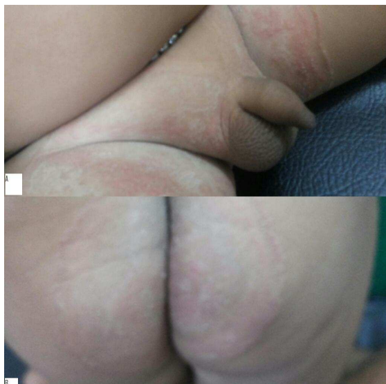
Figure 1 Multiple, erythematous, concentric and circumscribed scaly patches were present over the groins and gluteal folds.